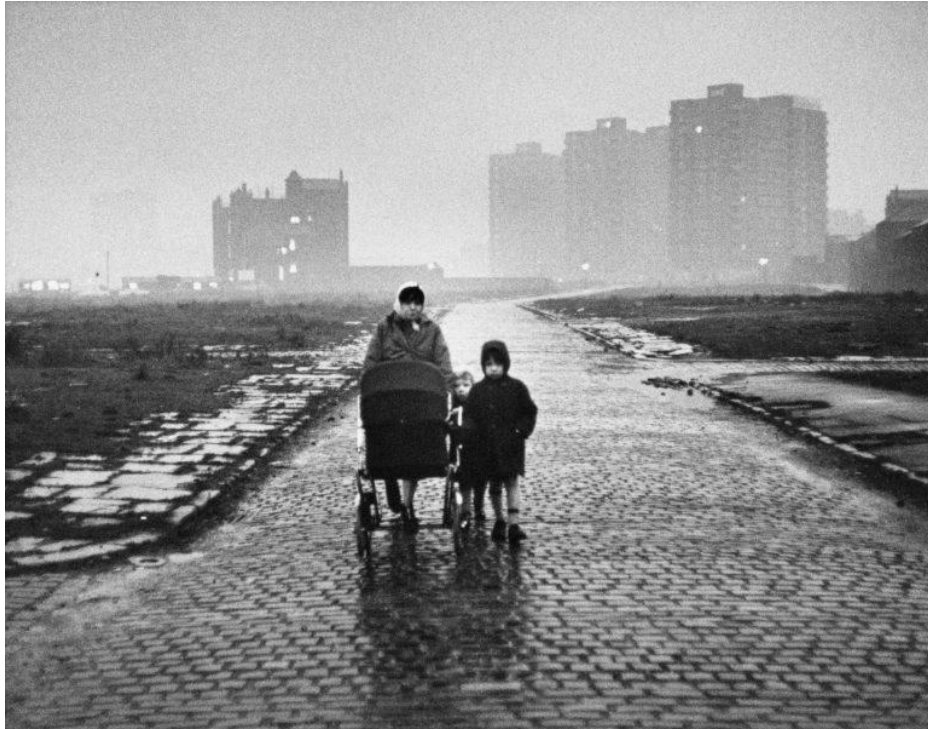
Capturing the Modern Backdrop: Shirley Baker Photographing Salford