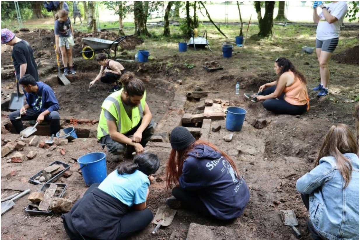
Community dig at Bolton's Hulton Park